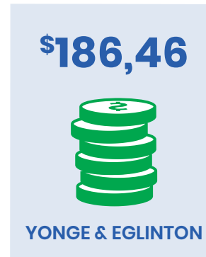
— AVERAGE HOUSEHOLD INCOME —